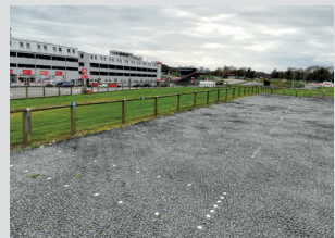
Hard surface parking within venue

Please note: At Grade D (smaller, club-level) events ALL parking is accessible through the main entrance only. For a list of Grade D events please visit www.msv.com .