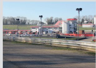
Southbank parking area

Please see map on reverse for entry and parking locations.